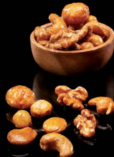
CARAMELISED COCKTAIL 80 g.

It contains: caramelised walnuts, caramelised Marcona almonds, caramelised hazelnuts, caramelised cashew nuts and caramelised macadamia nuts.