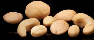
SALTED COCKTAIL 100 g.