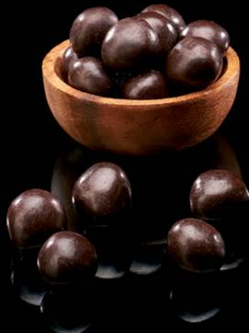
HAZELNUT CHOCOLATES 100 g.