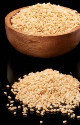
CARAMELISED SESAME 100 g.