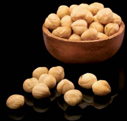
ROASTED BLANCHED HAZELNUT 100 g.