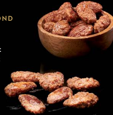
SUGAR COATED LARGUETA ALMOND 100 g.

Spanish Langueta almonds are the best variety for sugar coating. It is the most typical and traditional sugar coated product from Barcelona. One of our best-sellers. Try them with tea or coffee, on their own or accompanied with other sugar coated and chocolate coated nuts.