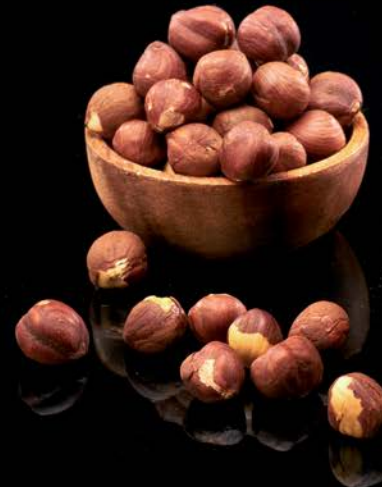
ROASTED HAZELNUT 100 g.

Be careful: you must peel it before eating! (also available without peel)