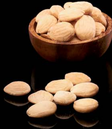
SALTED MARCONA ALMOND 100 g.

Eat them as a snack. Serve them as an appetizer; share them with your family and friends!