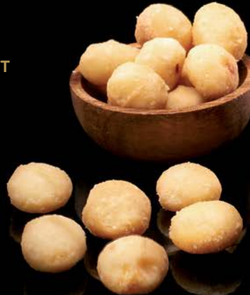
SALTED MACADAMIA NUT 100 g.

Top quality Australian macadamia nuts (grade "O"), salted with sea salt. One of the most select snacks or appetizers.