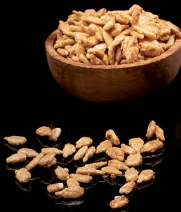
CARAMELISED SUNFLOWER SEEDS 110 g.

They are not only a tasty snack, they are a perfect ingredient for healthy salads. Try them also with yoghurts, for chocolate-making, as a topping, etc.