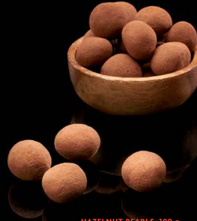
HAZELNUT PEARLS 100 g.

Caramelised hazelnuts, coated in white chocolate and cocoa powder. Serve them with tea or coffee. Eat them as a dessert.