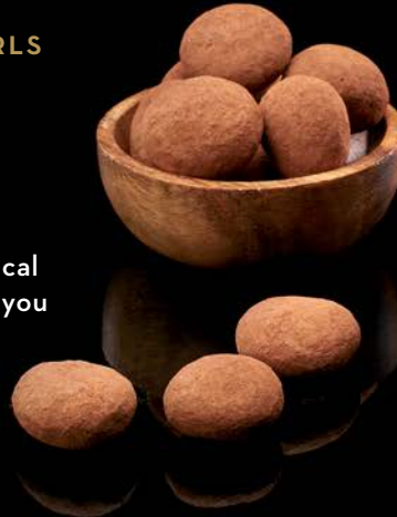
MARCONA ALMOND PEARLS 110 g.

Caramelised whole Marcona almonds (s/16 size), coated in white chocolate and cocoa powder. One of the most typical products of Catalonia, which you can find in almost every pastry shop. Discover our original recipe. Serve them with tea or coffee. Eat them as a dessert.