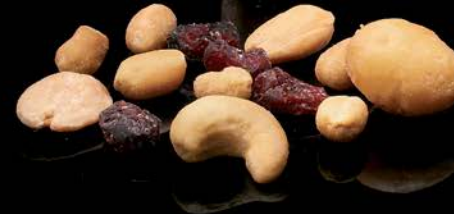
SALTED COCKTAIL WITH CRANBERRIES 100 g.