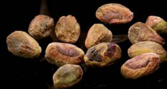
SALTED SHELLED SPANISH PISTACHIO 100 g.

It contains: salted Marcona almonds, salted peanuts, salted cashew nuts, salted macadamia nuts and dried cranberries. Discover this surprising combination! Eat as a snack or serve as an appetizer.