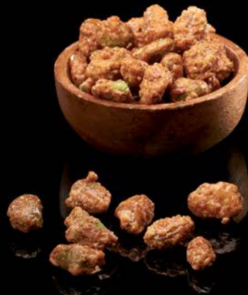
SUGAR COATED SPANISH PISTACHIO 100 g.

A new product created by Crit d'Or, launched with great success. Discover its surprising deep taste! Try them with tea or coffee, on their own or accompanied with other sugar coated and chocolate coated nuts.