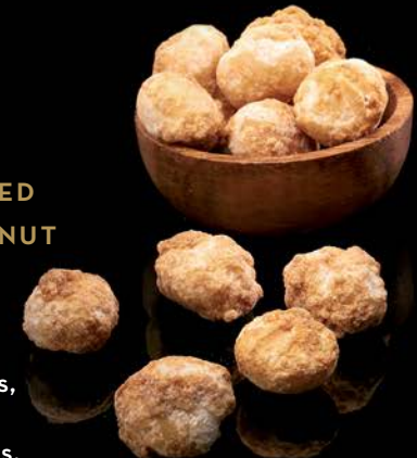
SUGAR COATED MACADAMIA NUT 90 g.

The sweetest macadamia nuts, another of our originals recipes.