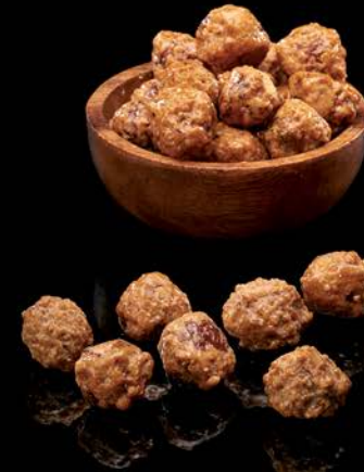
SUGAR COATED HAZELNUT 100 g.

Handcrafted sugar coated hazelnuts. Cooked slowly in a drum, following our artisan method. Try them with tea or coffee, on their own or accompanied with other sugar coated and chocolate coated nuts.