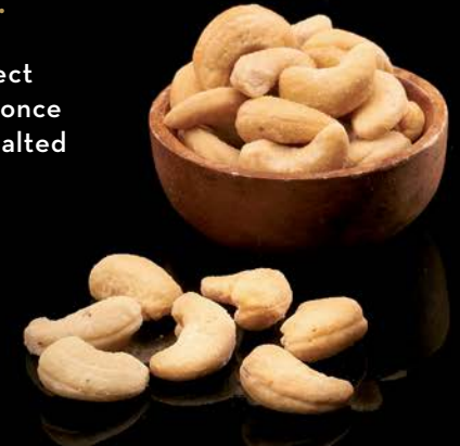
SALTED CASHEW NUT 100 g.

The most select cashew nuts, once roasted and salted with sea salt, are a perfect snack or appetizer.