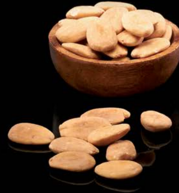
ROASTED BLANCHED LARGUETA ALMOND 100 g.