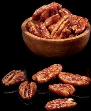
CARAMELISED PECAN NUTS 90 g.

Caramelised sunflower seeds and caramelised sesame: we created them specially for cooking. You will discover some of our recipes on the next page. Caramelised sunflower seeds are also a tasty snack!