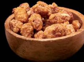
SUGAR COATED PEANUT 100 g.

Discover real handcrafted sugar coated peanuts. They're not what they seem!