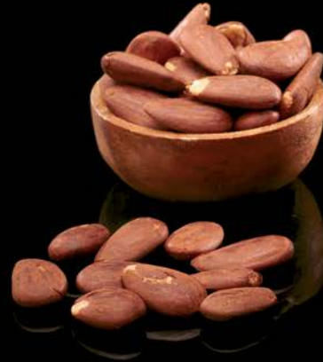
ROASTED LARGUETA ALMOND 100 g.

They are a healthy snack or dessert, perfect for winter time and cool weather. As a dessert, serve them accompanied with other nuts (roasted and raw) and a small glass of sweet wine. It's almost a ritual: we peel them with our fingers and we eat them as we drink and talk to each other, until tea or coffee arrives.