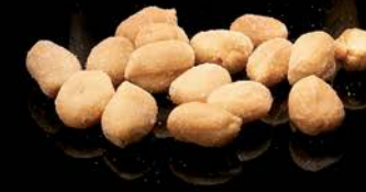
SALTED PEANUT 115 g.